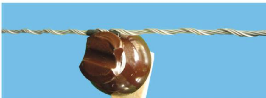
Fig Insulator side tie